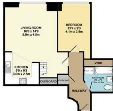
GROUND FLOOR APPROX. FLOOR AREA 606 SQ. FT. (56.1 SQ.M.)